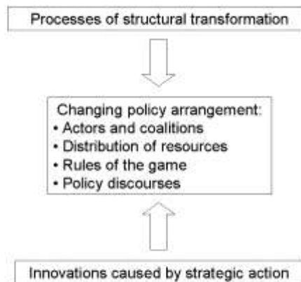
Figure 2. Dimensions of policy arrangements and influences leading to policy renewal. Based on Arnouts and Arts 2009.

The PAA also draws explicit attention to the context in which policies develop, namely the different kinds of social, economic and political processes that are changing the relationships between the state, the market and civil society, and that in their wake also initiate new conceptions and structures of governance. Grin (2010) labels these ongoing processes of structural transformation , or structural elements outside the direct grasp of policy actors that can be a source of political change. Examples are globalisation, the ideological shift towards market steering or the (financial) crisis of the welfare state.