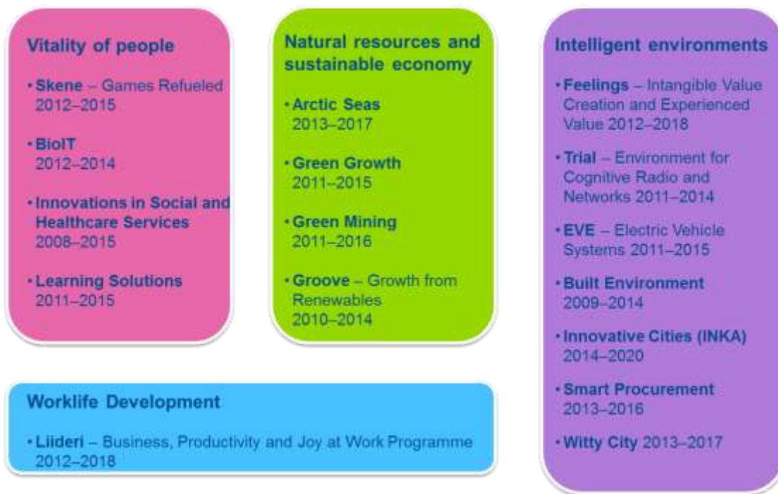
Figure 1. Examples of new Tekes programs

The best examples of programs with a holistic approach include the Green Growth, Innovative Cities (INKA), Witty City, Electric Vehicles and Systems (EVE) programs. The INKA program is the newest and has the strongest linkage to the government policy level. The INKA program also constitutes the main innovation policy context of the Finnish case study that focuses on the transition to smart transport systems in a city environment.